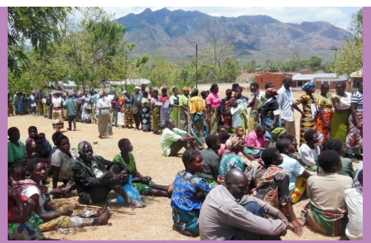
Beneficiaries of Malawi's Social Cash Transfer Programme waiting to receive their transfer in Mchinji District.

The ILO has designed a multi-level review process that will allow stakeholders to arrive at a consensus on key lessons from the MNSSP that are relevant for the MNSSP II.