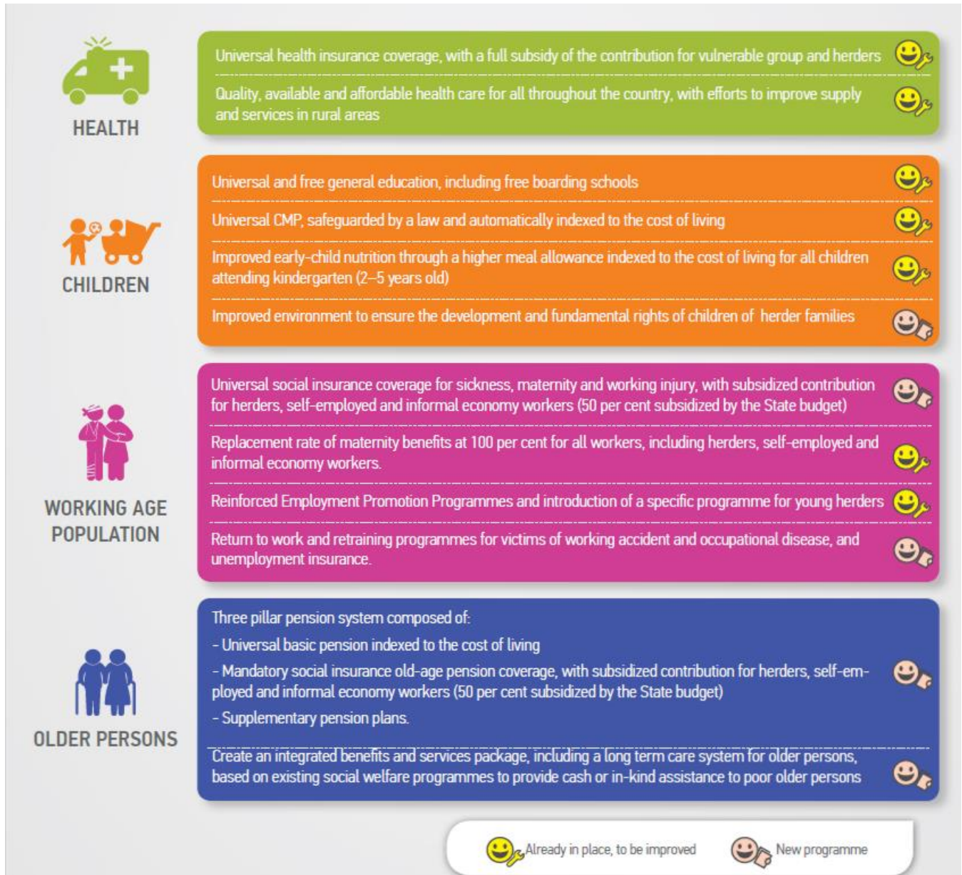
Figure 1. Definition of a social protection floor for Mongolia, agreed by the National Dialogue conducted in 2013-2014

Source: UN, Government of Mongolia, 2015: Social protection assessment based national dialogue: Definition and cost of a social protection floor for Mongolia (ILO, Ulaanbaatar)