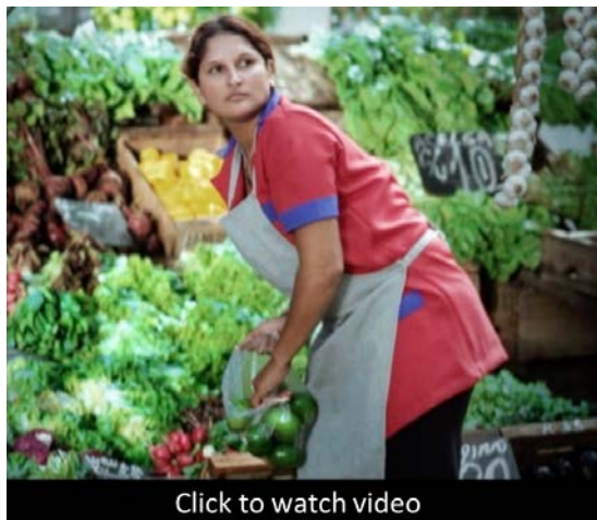
Click to watch video

This brief presents a successful country experience and gives a practical example of how SPFs can be implemented.