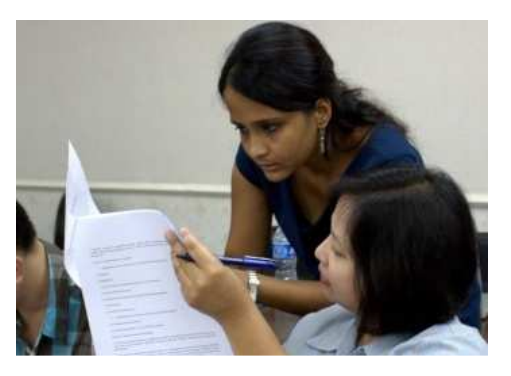
Participants comparing national laws with ILO's standards

specifically with unemployment benefits. While it sets minimum standards on social security, the Employment Promotion and Protection Unemployment against Convention, 1988 (No. 168) provides useful guidelines for designing and establishing unemployment benefits. In a practical exercise, participants compared national laws of selected