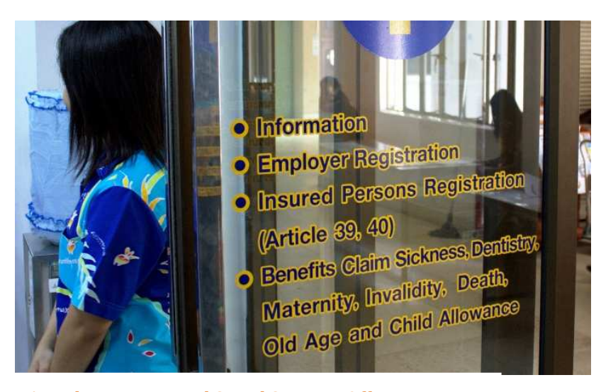
Ayutthaya Provincial Social Security Office

A field visit to the Provincial Labour Office of Ayutthaya helped understand how a one-stop-shop for social security and employment benefits can be practically implemented. The Provincial Social Security Office (SSO) has 5,500 registered enterprises and 320,000 insured persons. The Labour Office and SSO are housed in the same building. Services provided include domestic and overseas employment services, vocational training and career guidance, and also manages the foreign workers system. A unique counter at the Center helps direct beneficiaries to the most appropriate office for their needs.