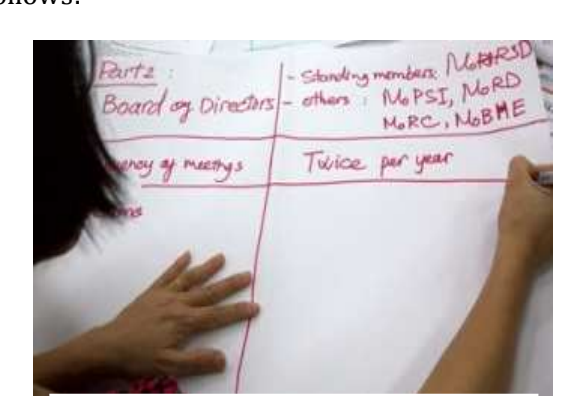
Group exercise on drafting a law