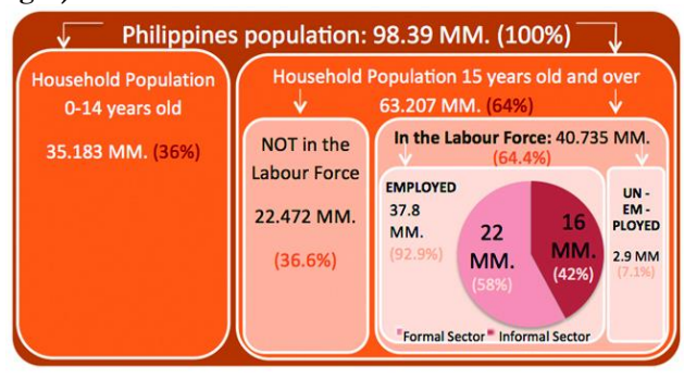
Figure 2: The Philippines labour market and its employment profile in 2014 (in million, MM, and percentages)<sup>28</sup>

It is important to bear in mind that the labour market in the Philippines is strongly dualistic: there is a shrinking formal sector and an expanding informal sector<sup>29</sup>, the latter, as mentioned above, with no proper social protection. However, there seems to be uncertainty about the overall share of the informal sector in the economy: on the one hand, it can be seen in the Philippines' labour market and its employment profile in 2014 that the informal sector comprises 16 million or approx. 42 per cent<sup>30</sup> of the employed force (see Figure 2). This is also confirmed by data in Table 1, showing the sector in which the majority of the informal labour force is employed. Unincorporated enterprises, that consist of both informal own account enterprises and enterprises of informal employers, but also labour relations without employers are part of the informal sector workers.<sup>31</sup> On the other hand, the World Bank (2013) estimates that "informal workers comprise about 75 per cent of total employment"32, which is close to the 77 per cent that the Employers Confederation of the Philippines estimated in 2008.<sup>33</sup> Besides the uncertain number of informal workers, which depends on the chosen definition, the majority of workers in the informal sector tend to have little or no protection, not only as regards the risk of job loss but also few opportunities to find gainful employment. About 79 per cent of the labour force and only about 28 per cent of the