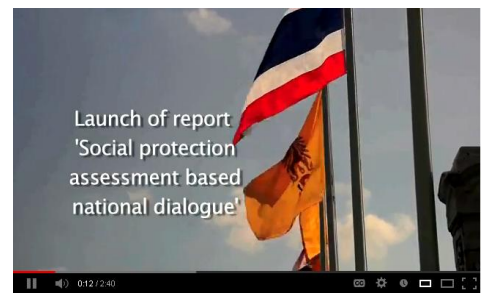
Video on the report launch