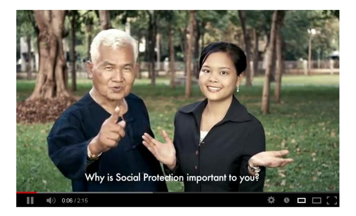
Video "Why is Social Protection important to you?" http://www.youtube.com/watch?feature=player_embedded&v=ZB40vK05xSs