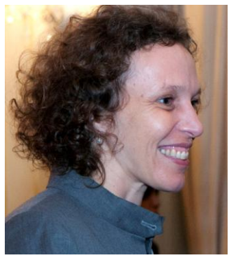
"Thailand really can afford to expand its Social Protection Floor."