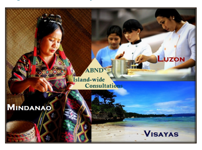
Stage 3: Endorsement of the SPF recommendations

The recommendations for establishing a national SPF were technically validated at the national level by the Core Group and at the local level through multipartite consultations held in the three island groups of the Philippines, namely Visayas, Luzon and Mindanao. This helped to ensure that the perspectives of all relevant stakeholders and ground-level realities were taken into account. This also contributed to making the process transparent and inclusive.