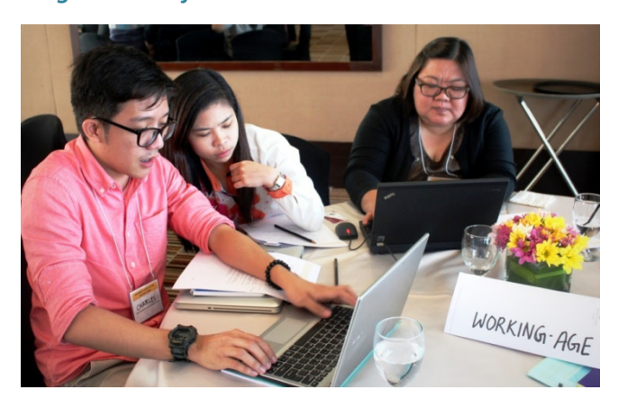
Stage 2: Cost of the SPF recommendations

The cost of the recommendations, i.e. the additional cost of establishing a national SPF, was estimated using a tool known as the Rapid Assessment Protocol (RAP). Parameters such as benefit levels and beneficiary groups were determined through dialogue workshops. During this stage, members of the CG were trained on the RAP methodology.