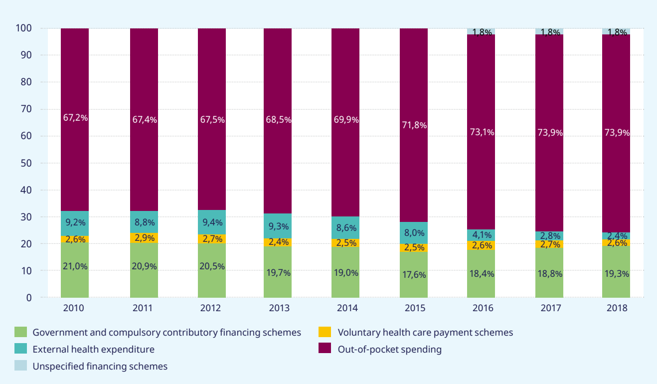
Figure 1. Analysis of total health expenditure in Bangladesh