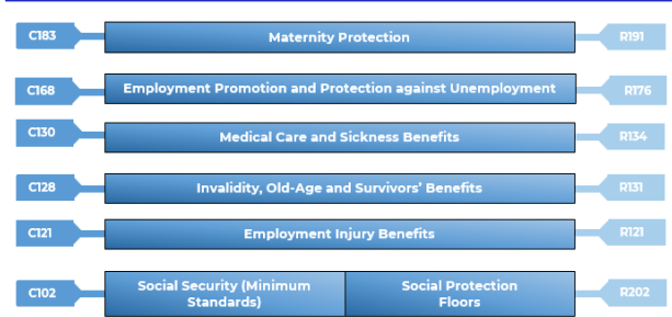
Figure 2: ILO up-to-date Social Security Standards

Building on Convention No. 102, the ILO subsequently adopted a set of five thematic Conventions, which establish higher standards of protection for most of the contingencies by reference to persons protected, and the levels of protection to be provided (see Figure 2):