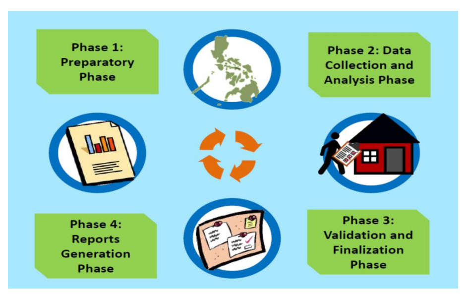
NHTS-PR Project Cycle

The NHTS-PR involves the following phases<sup>5</sup>: