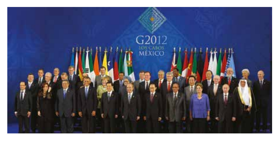
At the Los Cabos Summit in June 2012, the Leaders of the G-20 recognized "the importance of establishing nationally determined social protection floors."

To expand social protection to those without adequate protection, all ILO member States adopted the Recommendation concerning national floors of social protection, 2012 (No. 202), in June 2012. National social protection floors guarantee a basic level of protection for all residents and children. Countries should also progressively provide higher levels of coverage to as many people as possible. Social protection floors have been endorsed by UN member States, supported by the G-20 and acknowledged at many other forums.