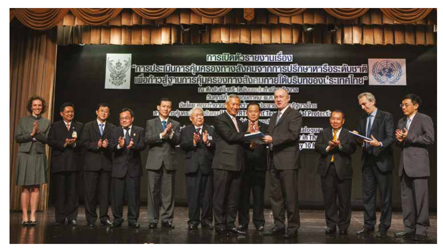
Launch of a joint assessment report by the UN SPF team and Royal Thai Government (2013).

However, continued progress requires resources that the ILO is unable to provide alone. These efforts require a material commitment from the international community and the development of new partnerships.