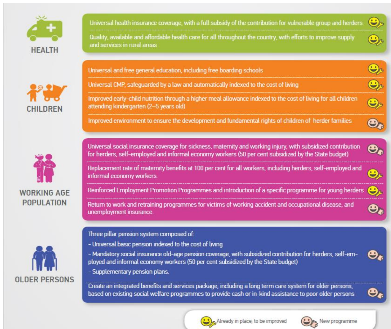
Figure 1. Definition of a social protection floor for Mongolia, agreed through national dialogue conducted in 2013-2014

Source: UN, Government of Mongolia, 2015: Social protection assessment based national dialogue: Definition and cost of a social protection floor for Mongolia (ILO, Ulaanbaatar)