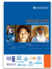
UNDG Social Protection Issues Brief, Asia-Pacific

Meanwhile, at the global level, the SPF will be advanced through the UN post-2015 development agenda, including a set of indicators and a monitoring system to track SPF implementation based on good practices developed at the regional and country levels. General guidelines and training packages will also be made available for further dissemination. Briefings for national delegations and key coordination bodies at the UN, as well as the creation of a global set of good practices in mainstreaming SPFs, are also envisaged.