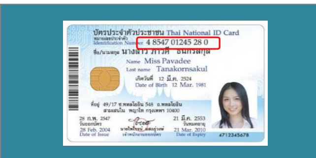
Figure 1: National ID number characteristics

One of the preconditions of the UCS implementation was to be able to identify its beneficiaries and to guarantee all Thai residents have access to one of the existing social health protection schemes.