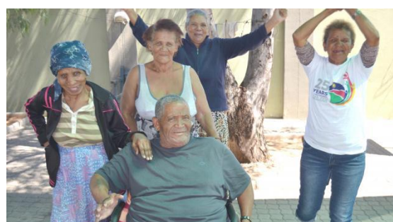
Namibian pensioners celebrated the increase of the national old age pension from N$600 to N$1,000 in 2015. Photo by the Informante newspaper, 1 April 2015.

the amount was increased from N$ 600 to N$ 1 100 (approximately US$ 78) as part of the social provisions of the Harambee Prosperity Plan prepared by the Office of the President. Persons with disabilities with a doctor's certification receive the same amount as older people. War Veterans' Subvention is about double the amount. Older persons, persons with disabilities and war veterans are also exempted from paying for any health services and are beneficiaries of the state financed funeral benefit scheme that pays for a burial amounting to N$ 3 000 (US$ 215).