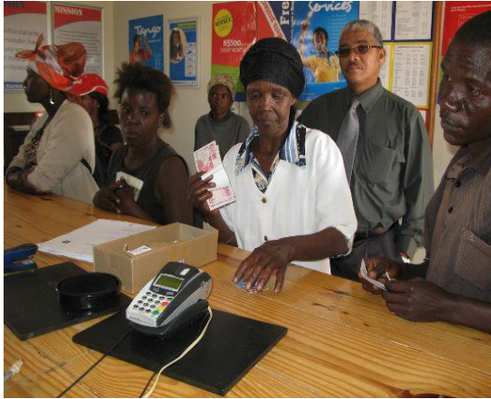
The Basic Income Grant was distributed through NamPost savings accounts.

The discussion continues on the costs and merits of universal versus targeted social protection transfers in a context of high inequality. One of the new initiatives on the table has been the universal Basic Income Grant (BIG) that was given a try in 2008 and 2009 in the village of Otjivero in Namibia.